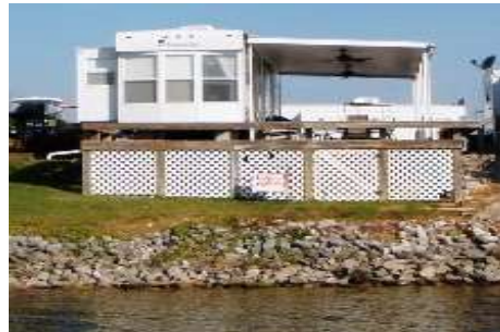
Choice Water Front Location