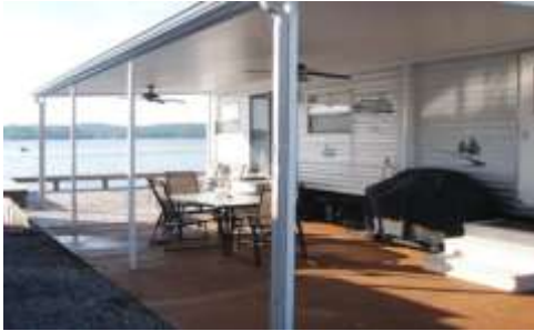
Concrete Patio with Carport

Enjoy a Magnificent Lake View at a fraction of the cost! Your friends can pull up for a quick visit at the pea gravel beach that's just steps away from your deck. Like new 2006 park model - 39 foot Woodland Park with 3 slide outs, concrete patio & carport and a deck overlooking the lake. Located on a choice waterfront lot at The Moors campground. Priced to sell! For more info contact Ray Barga at 270-994-4970