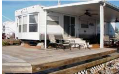
Oversized Deck & Awning