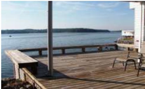
Fantastic View Overlooking the Lake